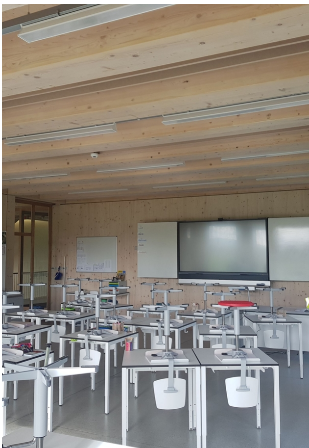
Interior of a classroom.