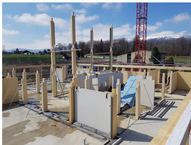
First floor under construction.