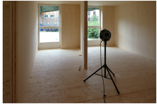
Sound measurement in the mockup