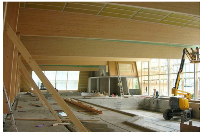
Shell interior view