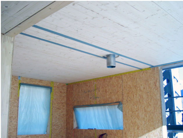
Interior view towards swimmer pool