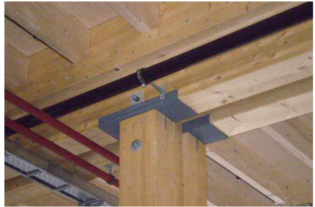
Transverse compression reinforcement with steel U-section, secondary supporting structure on bearing battens