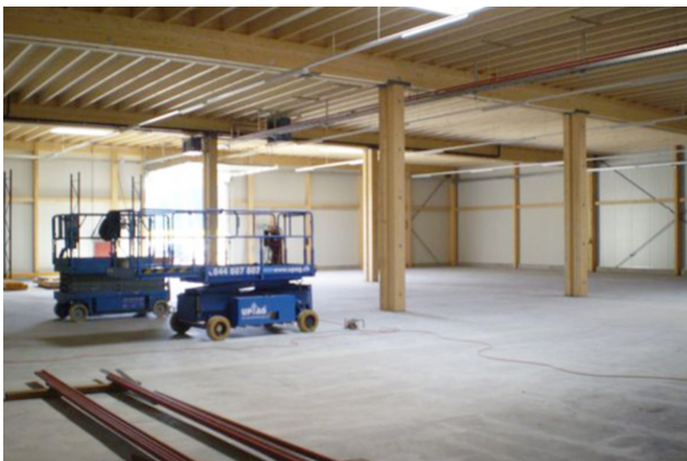
Interior view carcass

Twin girders made of glulam were chosen as the main girders, the girder dimension was 880 x 220 mm. The secondary structure consisted of ribbed slabs, the ribs made of glulam were glued above grade, rib dimension 320/80 mm, thickness of the three-layer slabs 42 mm. Wind bracing was provided by Swiss-Gewi bars arranged diagonally, with loads transferred directly to the foundations. Sandwich panels (d= 100mm) were used as external wall cladding.