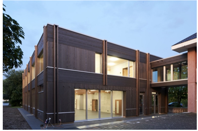
West facade with the seven meter wide window front and the passerelle into the old building