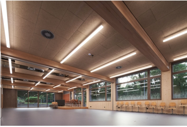
Multipurpose room with the beech wood joists and the folding partitions