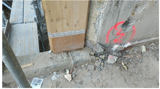
Connection of the wooden structure to the existing concrete elements