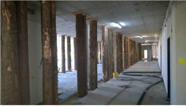
Temporary support with tree trunks