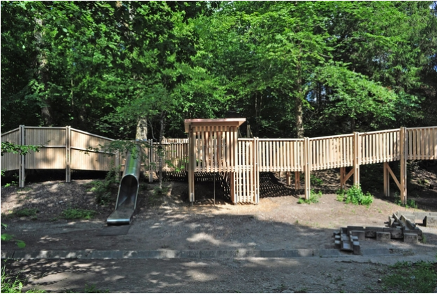
The new playground is 48 meters long and 42 meters wide, the tower is 7 meters high