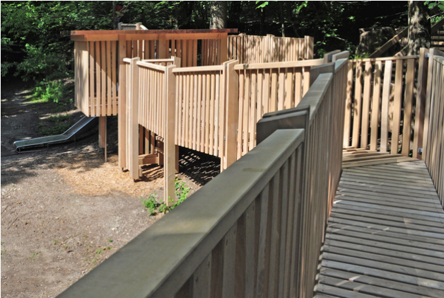
The playground offers a variety of play opportunities