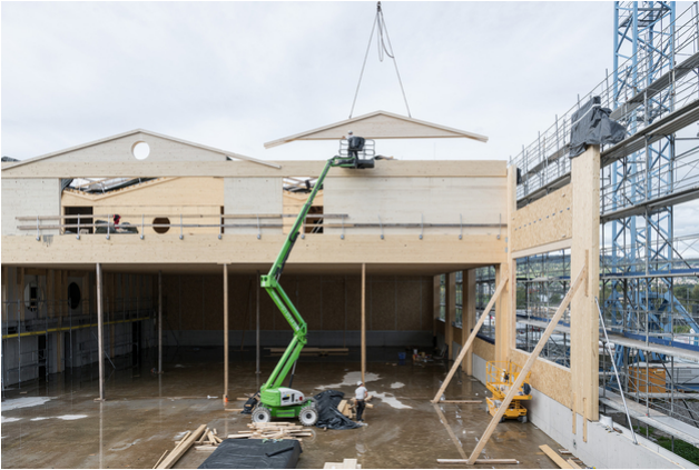
Timber Frame Erecting: The floor plan is being erected above the gym