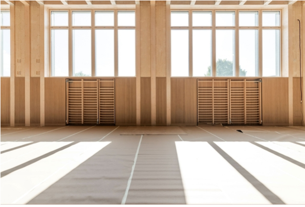
Interior view of the gymnasium during the shell construction phase