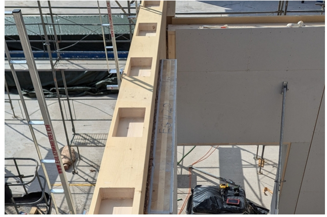
Milled pockets for accommodating the shear cams of the Vierendeel truss