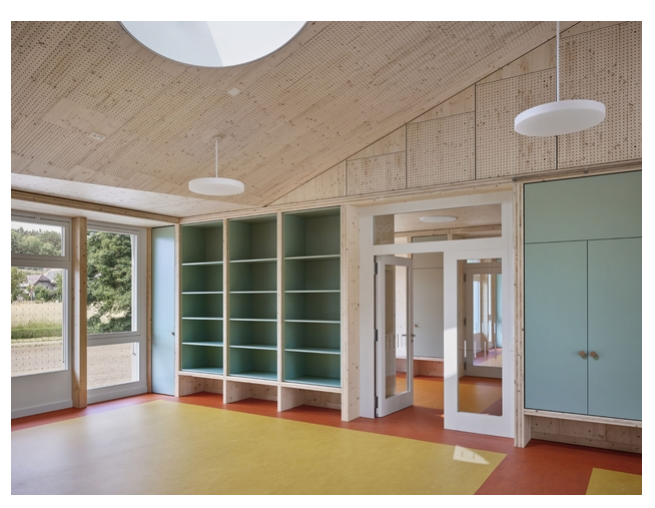
Harmonious color and materialization concepts in the interior