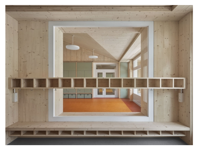
Wood as a leading element of interior design