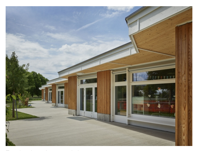
Exterior view after completion