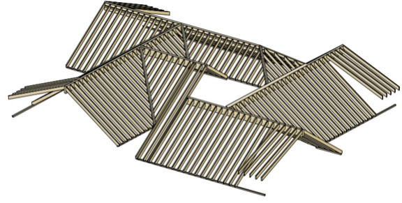
MFH view 3D