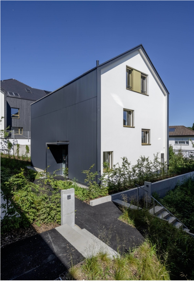
Single family house