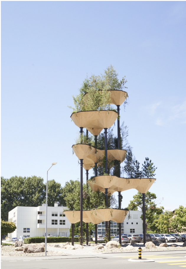
Semiramis in the heart of the Tech Cluster